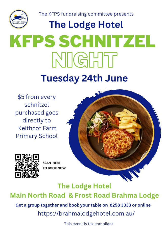
6 - Schnitzel Night @The Lodge Hotel - Tuesday 24th June