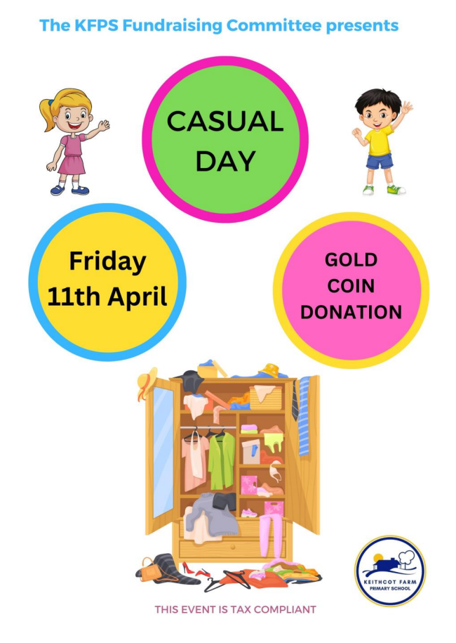
4 - Casual Day - 11th April - Sun Smart Clothing Only